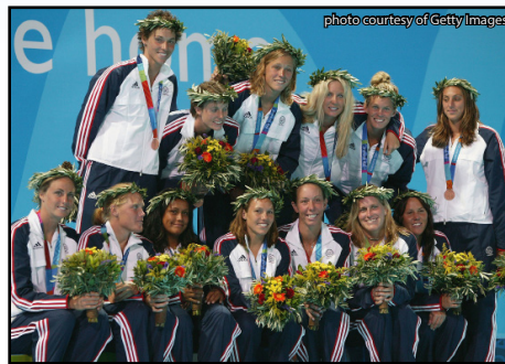
Team USA at the 2004 Olympic medal ceremony

Under the tutelage of former UCLA men's and women's head water polo coach Guy Baker, the U.S. women's water polo team earned a silver