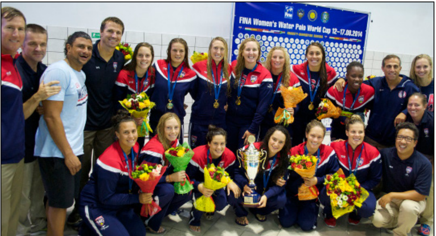
The 2014 FINA World Cup Champions