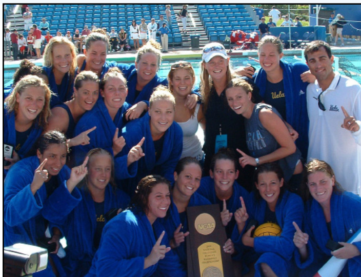
2003 NCAA Champions